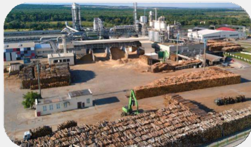
use in non-enclosed spaces