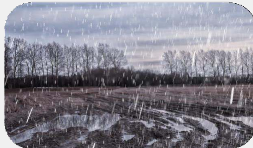
abrupt climate change during the day or seasonal precipitation conditions (spring - autumn months)