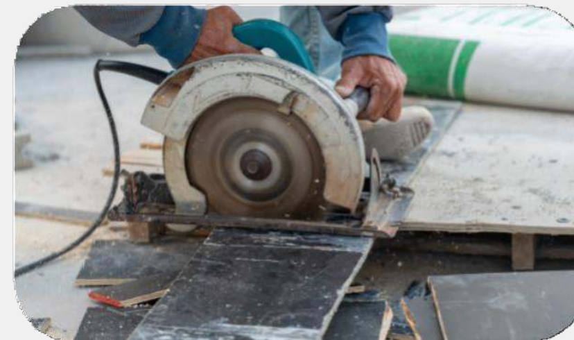
board trimming without proper processing of the ends and with the help of low - quality tools